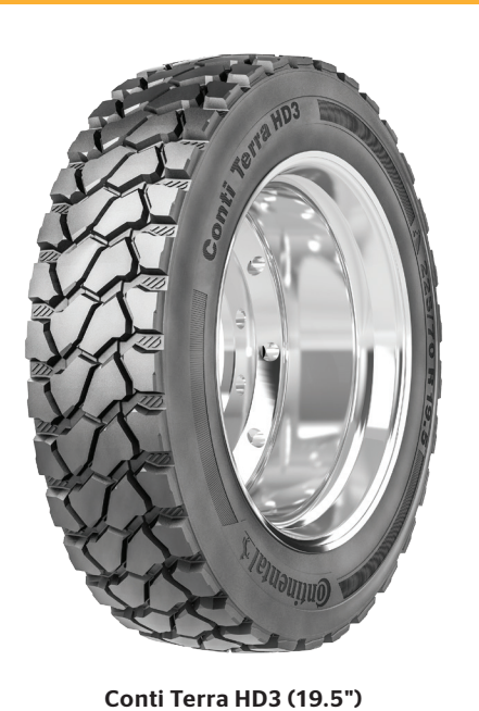
3G 💋 🐧 🔾 TIRE SIZE LOAD DEPTH 225/70R19.5 G 245/70R19.5 H 19