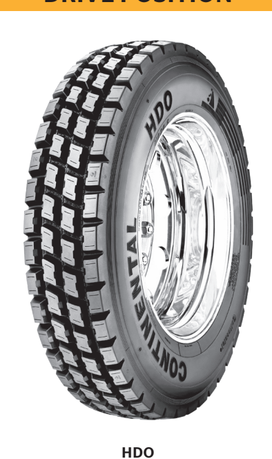
3G 💋 👌 🔾 TIRE SIZE LOAD RANGE 11R22.5 H