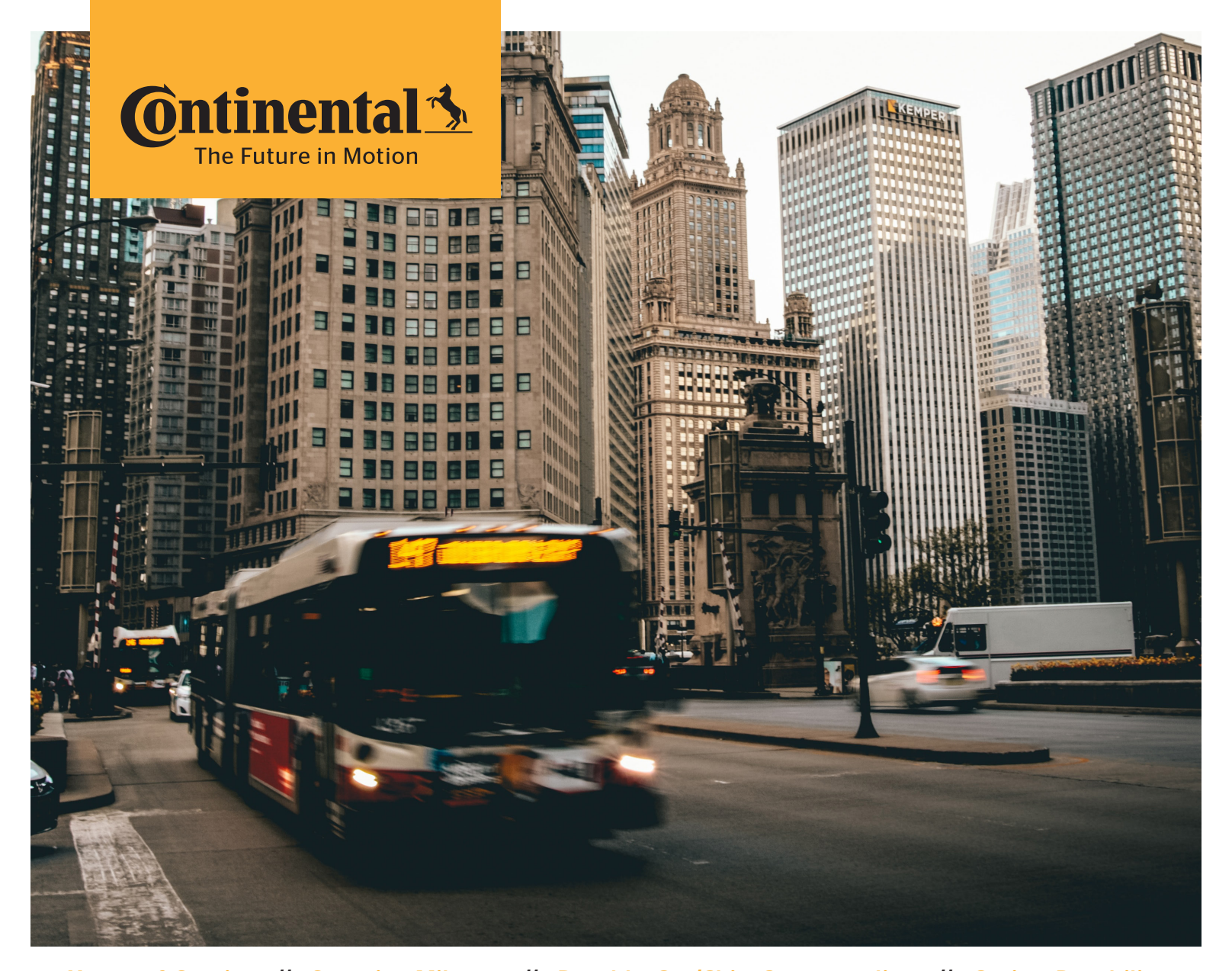
Hours of Service // Superior Mileage // Durable Cut/Chip Compounding // Casing Durability