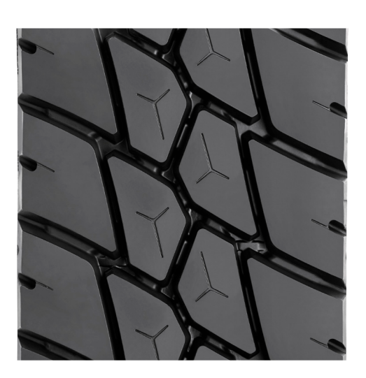
HDU 3 WT 3 0